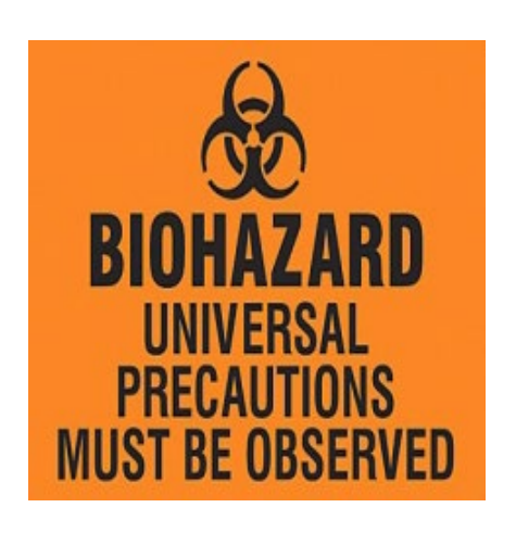
Figure 1b: Biohazard Label (Universal Precautions)