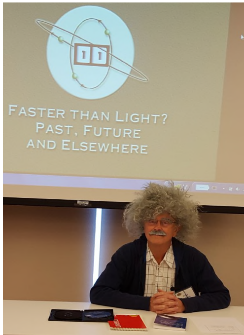
The ghost of Albert Einstein visited his class on Relativity and the Quantum Revolution on Halloween.