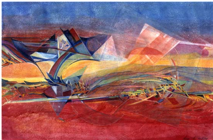
Southwest Visions, 19 x 25

Anne Sullivan's work in contemporary water media is an ongoing exploration of color, texture and design. Surface quality is an important consideration and is developed in several ways. Watercolor and acrylic paints and inks are applied in layers to a variety of papers. Texturing may involve painting techniques, collage materials, or the use of various media such as gesso, acrylic gels, lava sand or modeling compounds. The design elements used are geometric symbols inherent to most cultures. The works are built slowly creating a