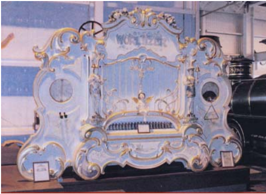
Wurlitzer style 165 Military Band Organ which will play both the Star Spangled Banner and American Patrol

Next we saw a video highlighting each of a long list of patriotic songs, and each segment gave a biographical sketch of the composer, and the song was played by a mechanical organ. These organs that played the songs were