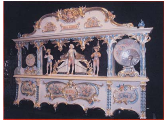
An 80-key Gebr. Bruder fairground organ used to demonstrate Over There