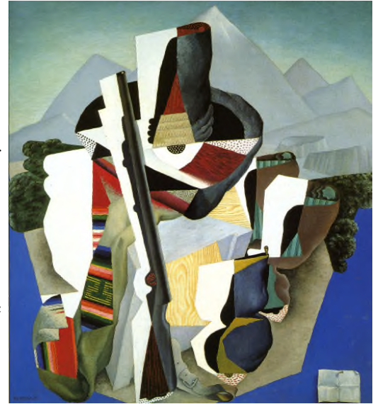
Zapatista Landscape by Diego Rivera

Two of the best known Mexican artists in modern times are Diego Rivera and Frida Kahlo. Each was considered very controversial due to their membership in the Communist party and their very flamboyant life style. Each was greatly affected by their early exposure to the inequalities of wealth in Mexico. During the 20's and 30's, the art and political movements stressed the need to give more rights to the poor in their country.