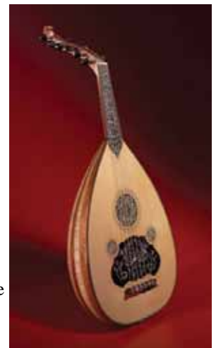
Oud, Middle Eastern musical instrument, 1992 Peter S. Kyvelos Belmont, Massachusetts Curly maple, paduke, spruce, Delrin, synthetic mother-of-pearl, strings