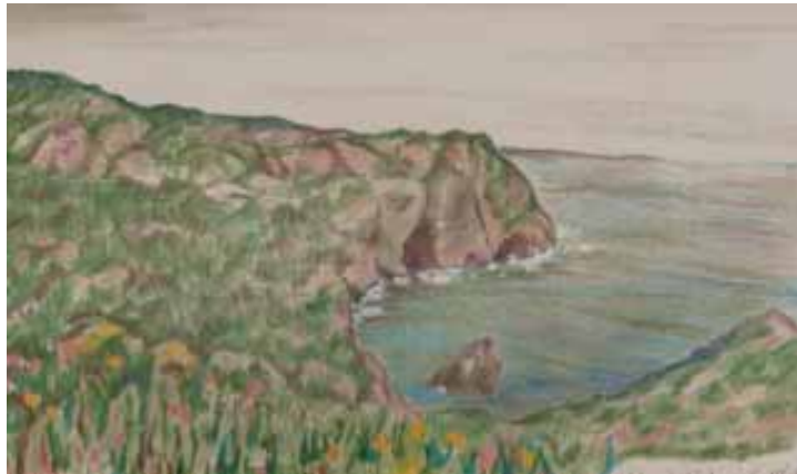
Roca, Portugal - Colored pencils

While studying the wall map of the sixteenth century world in the Maritime Museum in Lisbon, my eyes followed each colored line marking trade routes of Portuguese empire builders. The first expeditions were around Africa, followed by voyages to India, Timor (Spice Islands), and finally halfway round the globe to Japan. One is awed by the successes of expeditions which used the astrolabe, logs and letters exchanged between captains. These adventures on the high seas were spurred by Prince Henry the Navigator. Also in the museum are models of the caravel, which intrigued me. It was a shallow draft sailing vessel preferred by Vasco de Gama. Later I spied it depicted on a vaulted ceiling in the magnificent National Palace in Sintra.