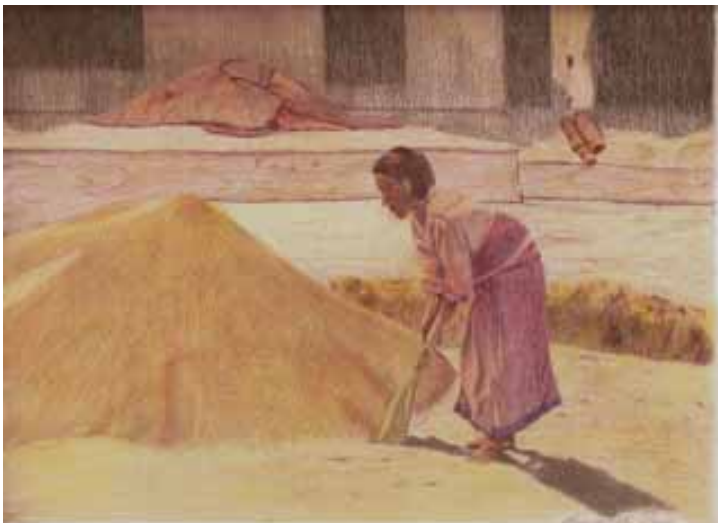
Bungamati, Nepal - "Drying Rice"