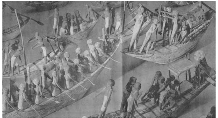
Example of wooden boats found in Tomb 10A