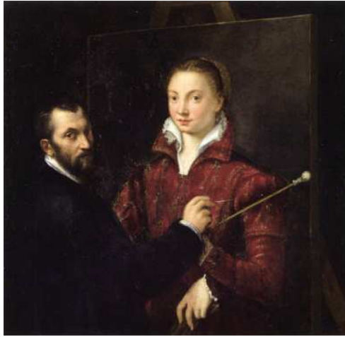
Bernardino Campi Painting Sofonisba Anguissola by Sofonisba Anguissola, late 1550s

Both Pliny the Elder and Younger made records of female artists, a great resource for Renaissance artists. In 1292 Hildegard, a nun, painted visions trying to comprehend the world beyond her convent. In a time when paintings were not signed, she paints a small portrait of herself in a lower corner. Christine de Pisane, whose father was a scientist, was educated, not usual for women in those times. She presented several of her paintings to Charles II. In 1550 Sofonisba Anguissola painted a self portrait which was praised by Michelangelo and is now at the MFA.