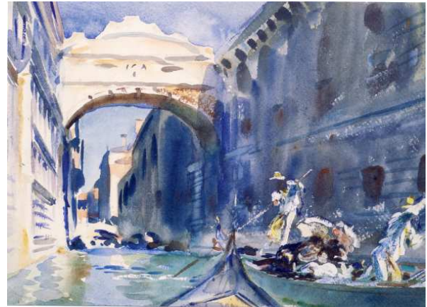
The Bridge of Sighs by John Singer Sargent, 1903-4